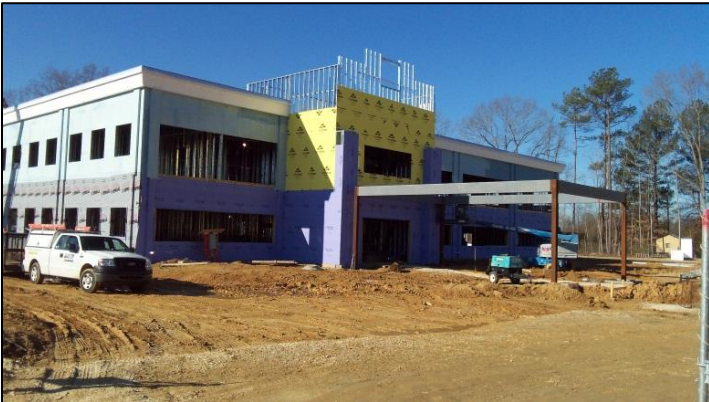
Brightwater Business Park