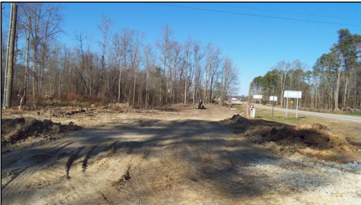
View from McKinney Parkway toward First Choice