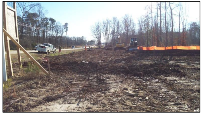
View from First Choice toward Courthouse